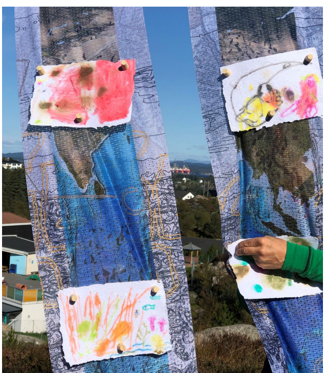
Figure 11, Children's Ocean portraits, photos by Åsta Birkeland

Based on the ethnographic narratives and previous research on literacy and ocean literacy, we have explored the possibilities of working with children and staff in kindergartens in marine milieus through a collaborative arts and pedagogy project.