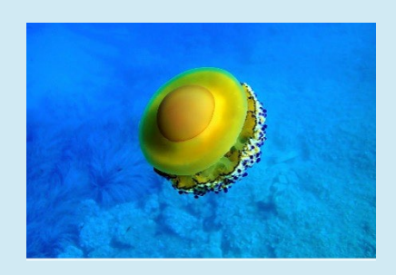
Figure 8, Deep sea creatures, photo with permission to republish by Laurence Madlin/Getty Images/Laurence Madlin/Popular Mechanics.

Please note: The starting point for such an intro is the mediator's own fascination with the images they find. This means the joy of sharing, which in turn serves as a source of inspiration.