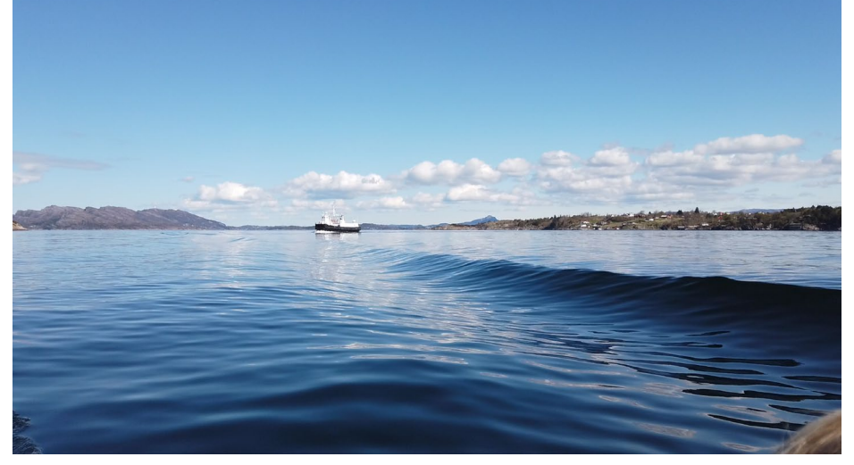
Figure 5, The big wave, photo by Eya Oropilla.

There was suddenly a big ferry nearby—its approach produced rocking waves. The waves were smaller at first, then grew bigger as it approached the small boat. Tod turned off the engine. It would be dangerous for the small boat to cruise fast on the rocking waves. Everything and everyone were still but the small waves rocked the boat.