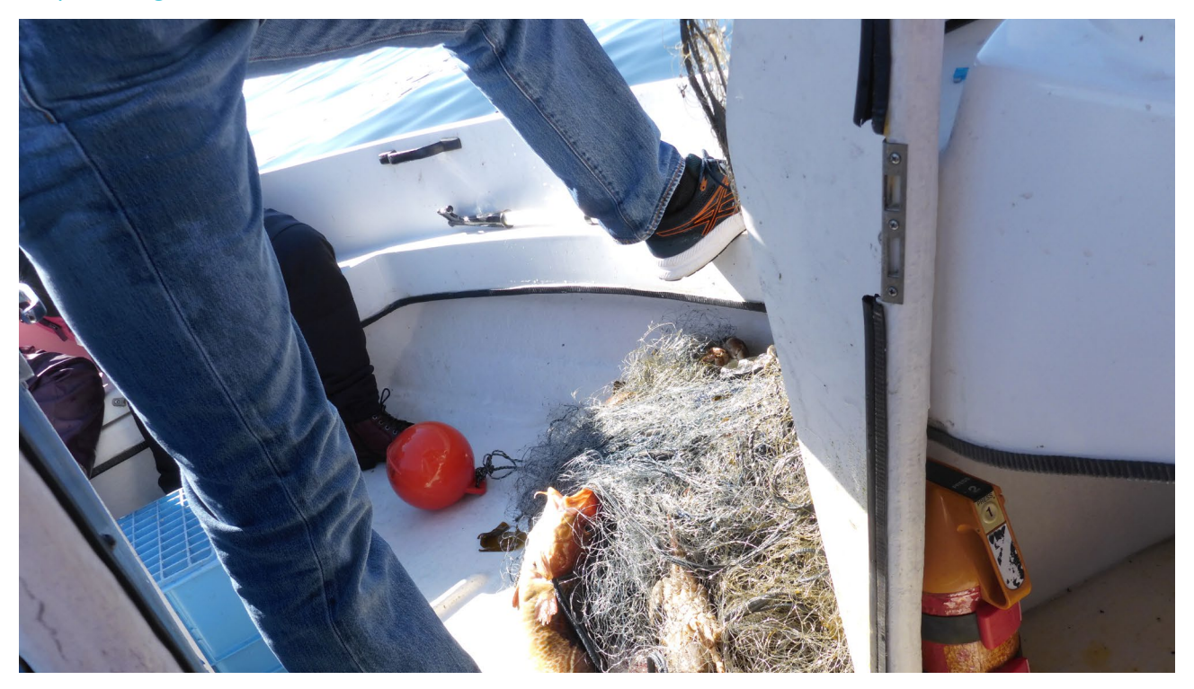
Figure 7, The fish net, photo by a child from Klokkarvik barnehage