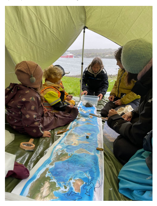
Figure 3 The world that binds us together and keeps us apart

The above fieldnotes and figure 2 illustrate how the project allowed us to explore the landscape and discover details in the biotope between the land and sea. The kindergarten allowed the children to wade into the sea. This created unique moments of feeling in direct relation with the cold water, and we could feel the movements. This experience was fascinating; the children walked and watched for a long time, and it was as if they had found their home element. Children's attraction to water has also been noted by other early childhood researchers who have emphasized the more-than-human relational experience (Ødegaard, et al., 2023; Djohari et al., 2018; Pacini-Ketchabaw & Clark, 2016; Somerville, 2013). The task of finding a stone of one's own choice was appealing to us all; we became connected and noticed many aesthetic and sensory details, like the cold and wet feeling when reaching out to pick a stone as well as the shape, colour, taste, and smell. To select and study the small stones gave the children a new repertoire on the aesthetic qualities of a stone and what it could represent. Throwing stones in the water, which is often the main repertoire of children on a stone beach, was not a dominant activity here.