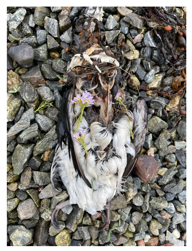
Figure 4. A dead sea bird with a flower

Some days later, we went to the beach, and we were again reminded of the changeable world on this permanent beach. This day, the artists had prepared shelters for us on the field close to the beach. It was a rainy and windy day, and the task for the day was to study a world map by playing with our stones. However, something else turned up on the beach: heaps of dead sea birds were lying on the beach and on the grass.