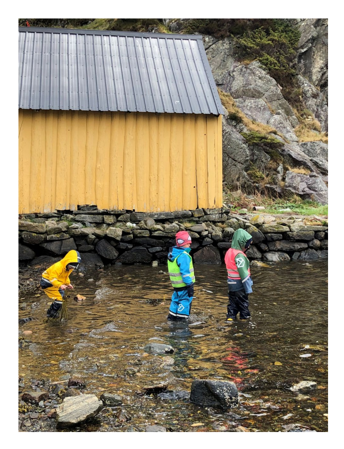
Figure 2. Sensing and imagining the ocean

One of the kindergartens was situated a five minutes' walk from Spildepollen bay. We passed some boathouses, some small boats, and a supply boat for the oil rigs to go down to an area of about one acre of land, a green field of grass sloped down towards a stony shore. The April spring had brought cuckoo flowers on the field and in front of a rocky area; sheltered from the wind, there was a small area of birch, willow, and hazel bushes with fresh green leaves.